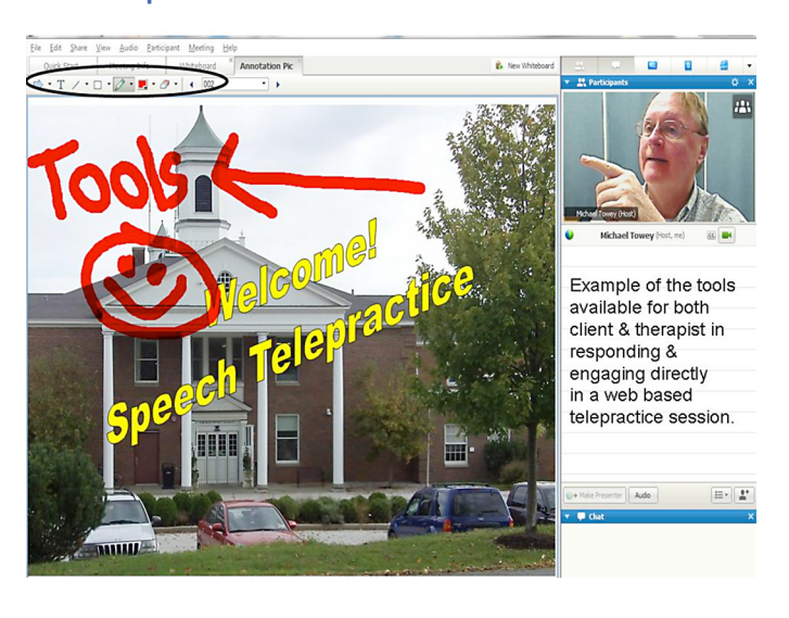
Figure 2: A screen shot of web-based telepractice that features authentic materials and an array of therapist/client response tools.

A web-based model allows both the therapist and client to work in online programs in a true digital learning environment (Christensen, Johnson, & Horn, 2008). Therapy sessions can be recorded, edited, saved and later viewed online by the client, caregivers, family members and/or teachers who are granted access to the materials. The client can go online multiple times to access the therapy program for additional practice and learning. The therapist has the ability to monitor the client's responses to virtual therapeutic materials as often as desired before the next scheduled treatment session.