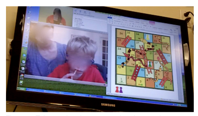
Figure 1. Telepractice therapy session. Image shows parent sitting next to child and facilitating session and board game shared via the VSee screen share utility. Clinician is shown in upper left hand corner.